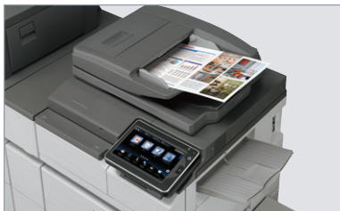
Single pass, dual side scanning at up to 200 IPM