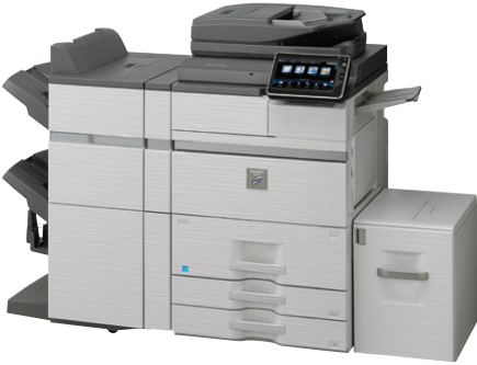
MX-M754N shown with options.