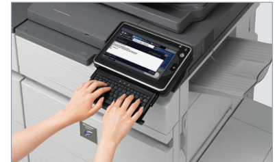
Standard retractable keyboard simplifies data entry