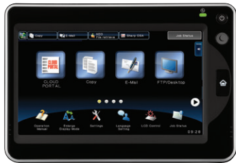
Tablet-style touch-screen display with intuitive menu navigation.

The Sharp MX-M654N and M754N monochrome workgroup document systems deliver high productivity and strong versatility.